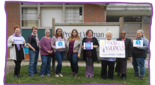
Project Woman staff wore purple to promote Domestic Violence Awareness