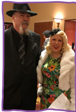
Guests at our 5th Annual DIVA Night Out, dressed for the 40's theme