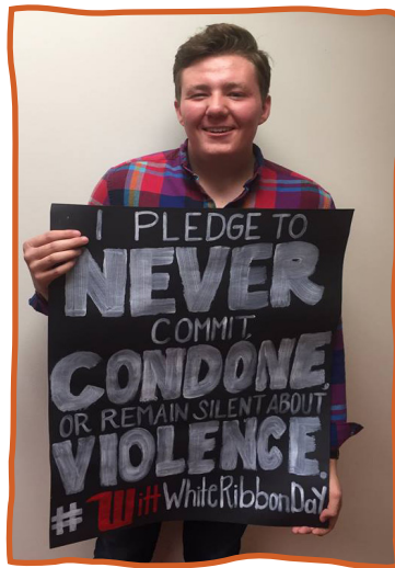
A Wittenberg student pledged support against gender-based violence

For more reading: www.alanberkowitz.com and www.keithedwards.com