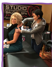
Pampering Stations at DIVA