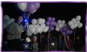
5th Annual Balloon Launch at Urbana University